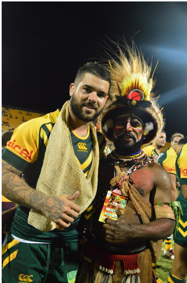
2015 PM's XIII match

Workshop outcomes document 28 March 2017